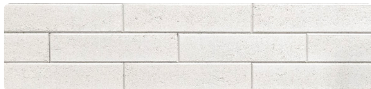
FINLAND† | Non-Stocked

†Lead time varies depending on manufacturer and transit lead times.