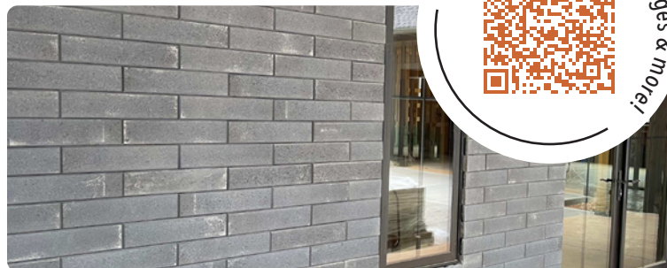
SET IN BRICK » COAL | Maxum Dry-Stack