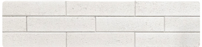
FINLAND † | Non-Stocked

Looking for a mortared look? Maxum can be installed with a traditional mortared format. We recommend you reach out to your local technical representative for details.