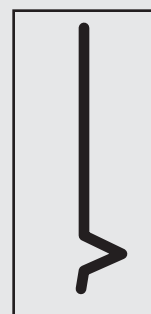
Profile view of Driwall™ Weep Screed

This product is required by all major building codes & the International Building Code at the bottom of all framed walls.