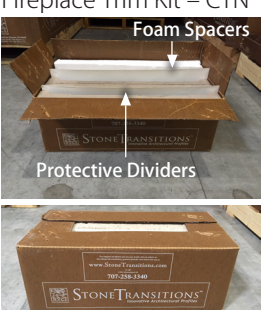
Fireplace Trim Kit – CTN