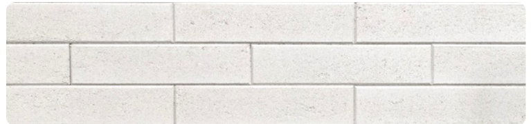
FINLAND † | Non-Stocked

† Lead time varies depending on manufacturer and transit lead times.