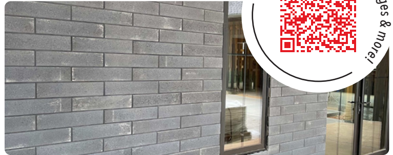
SET IN BRICK » COAL | Maxum Dry-Stack