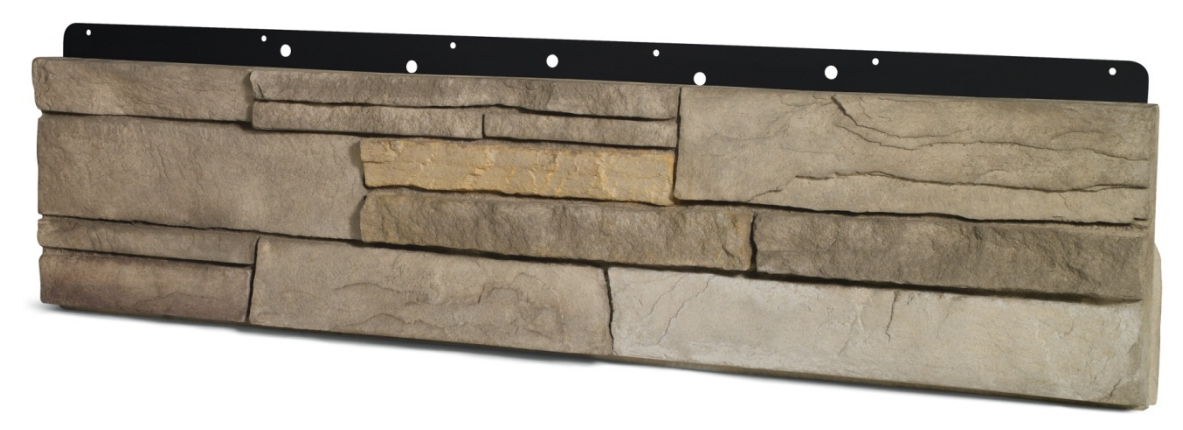
Figure 1: Versetta Stone® Panel with Nailing Hem (across top of panel)