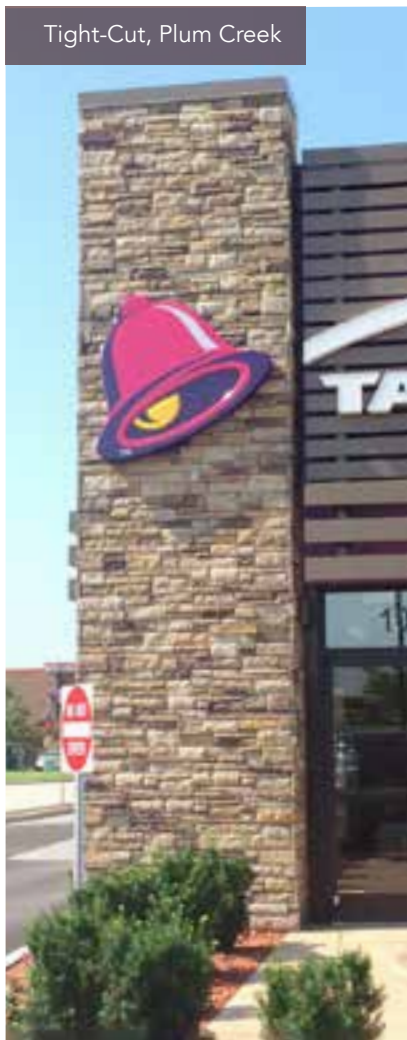
Tight-Cut, Plum Creek