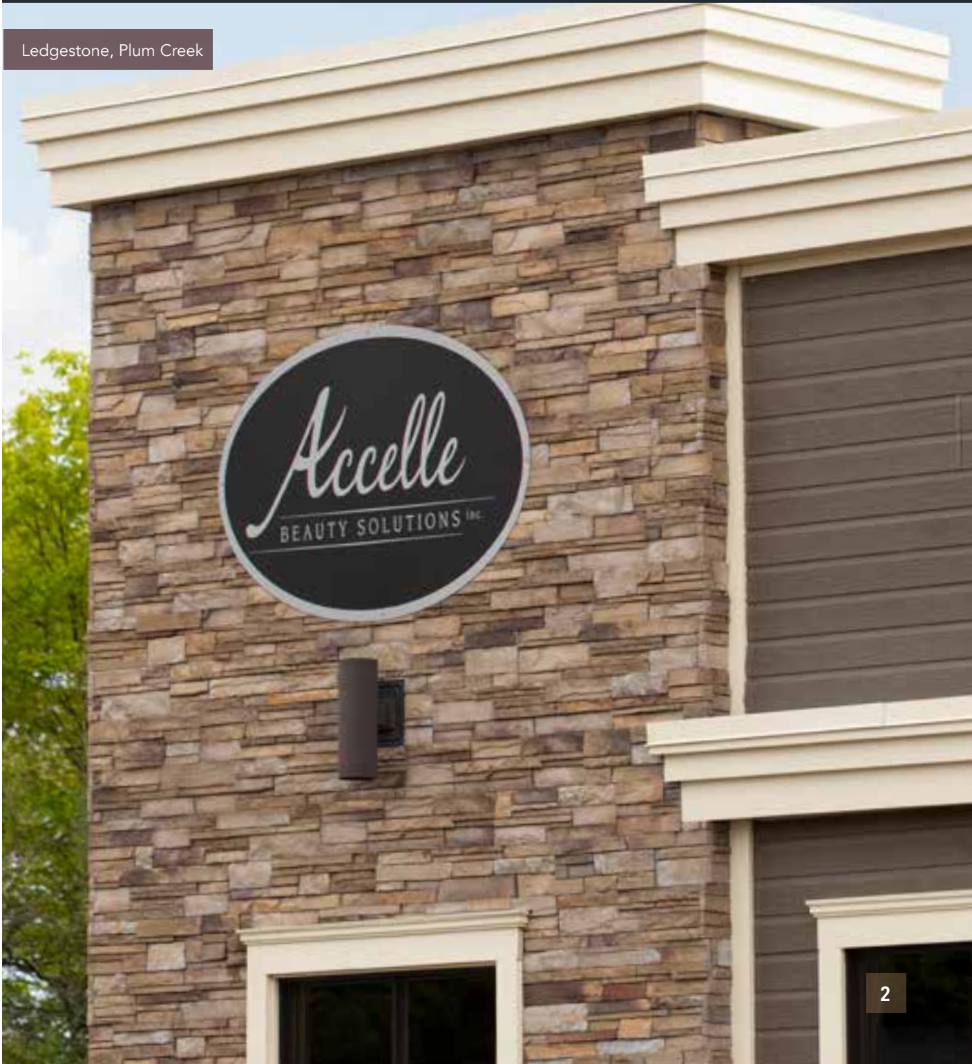
Ledgestone, Plum Creek