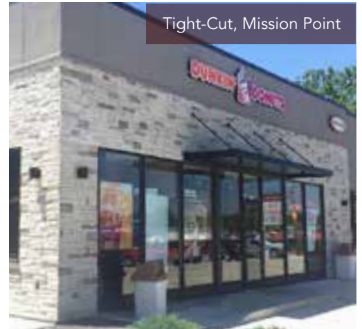
Tight-Cut, Mission Point