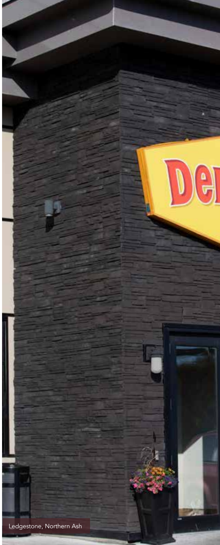
Ledgestone, Northern Ash

See install tips and videos at VersettaStone.com/installation