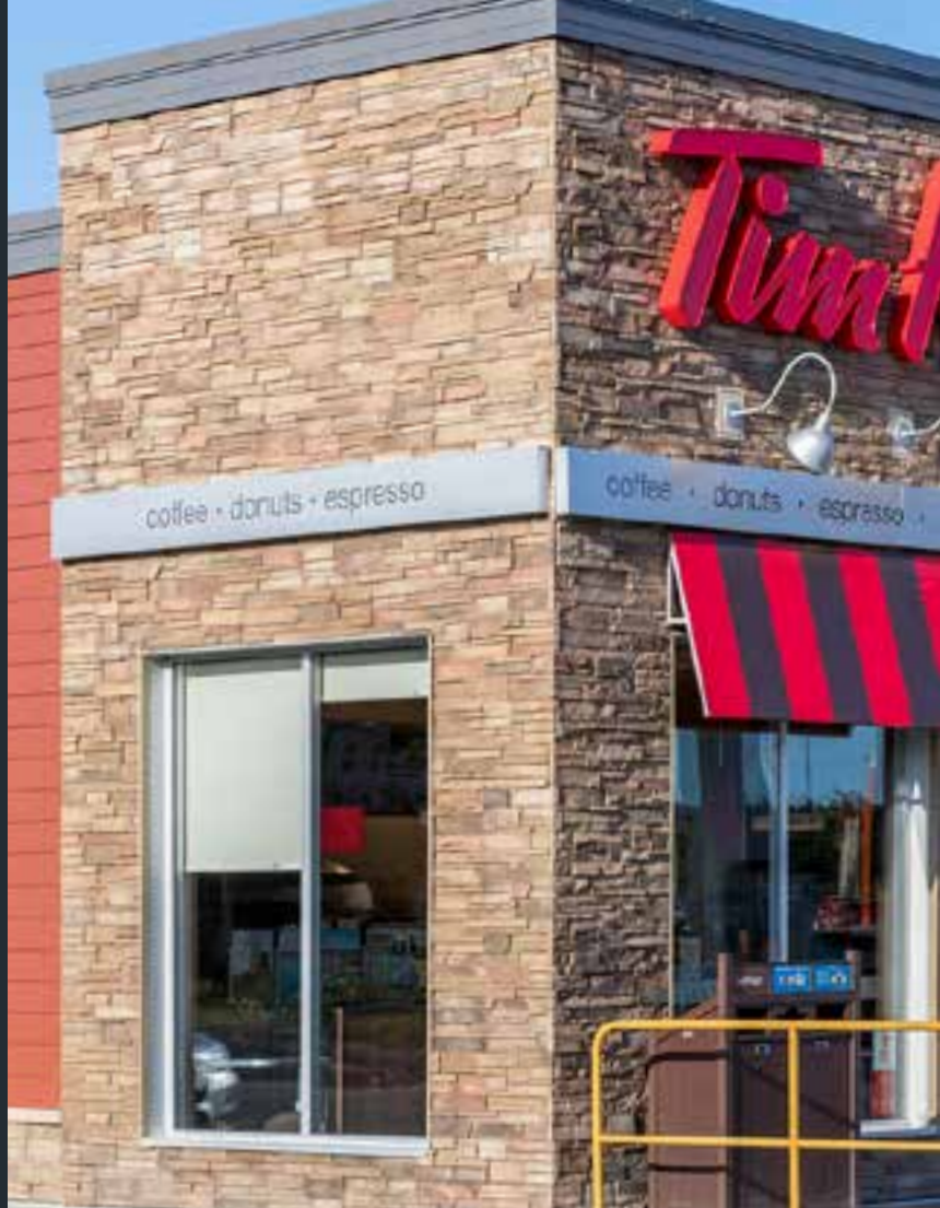
Tight-Cut, Mission Point

Use Versetta Stone on interior walls to add interest to reception areas and showrooms. It can be installed on virtually any standard framed wall with sheathing.