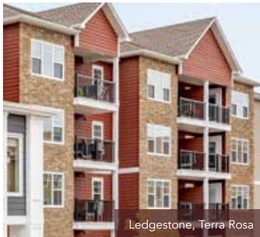
Ledgestone, Terra Rosa