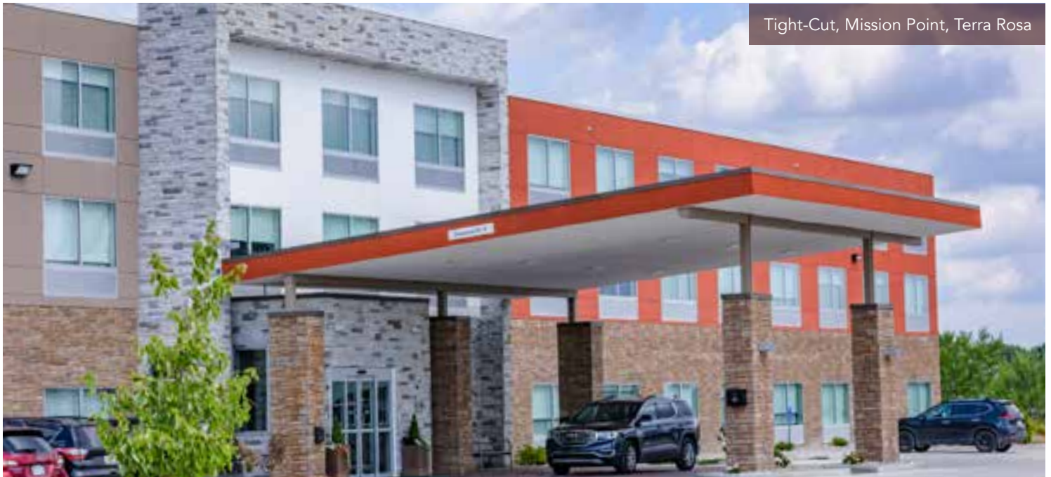
Tight-Cut, Mission Point, Terra Rosa