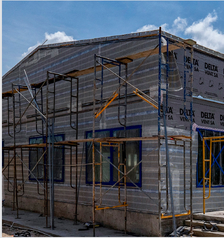
DELTA®-DRY & LATH complies with ICC-ES AC 275 and meets ASTM E2925-17.