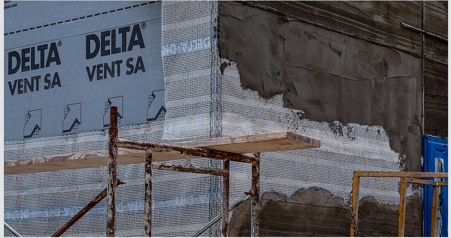
DELTA®-DRY & LATH is extremely durable and will protect the building from moisture damage well into the future.